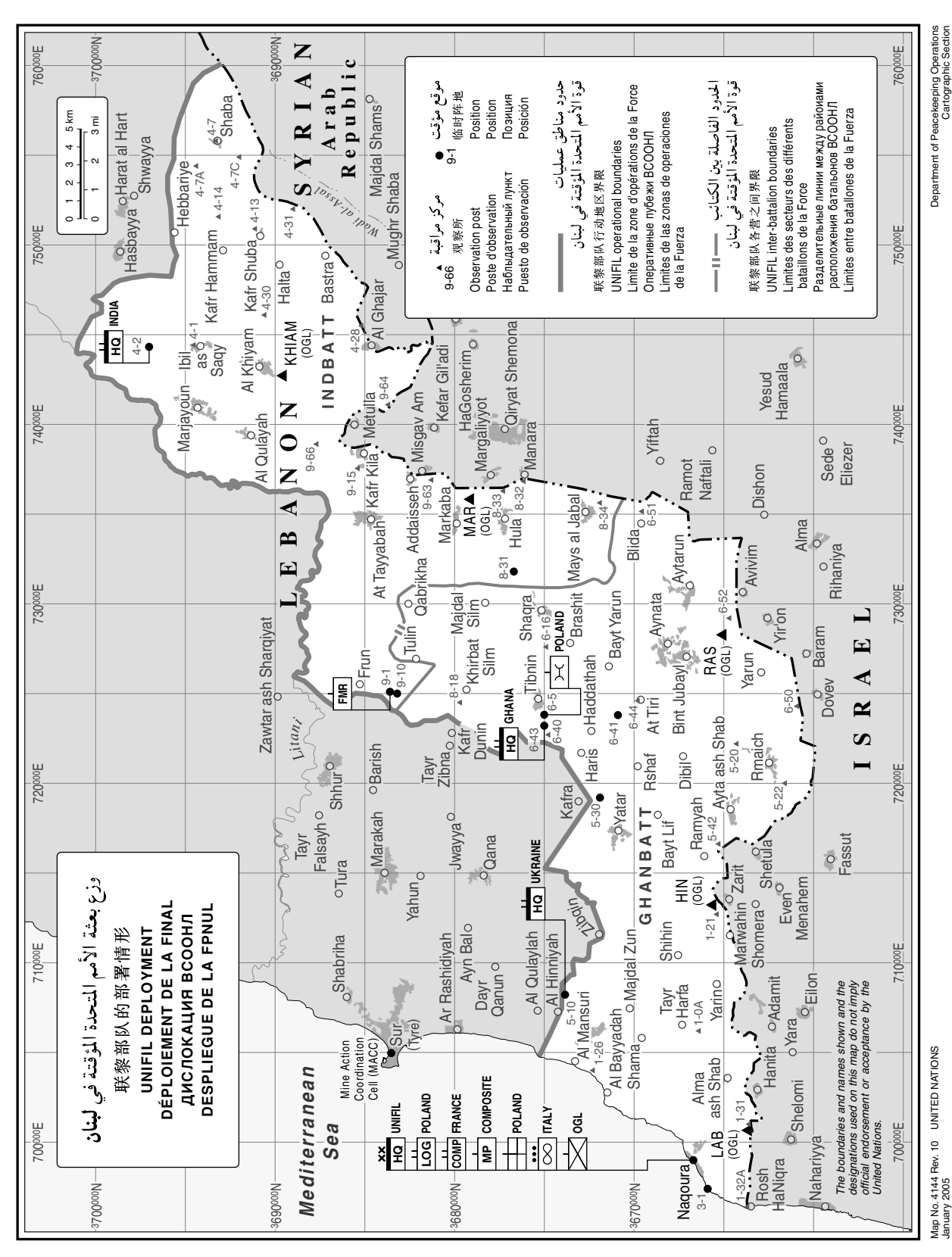
Map No. 4144 Rev. 10 UNITED NATIONS January 2005